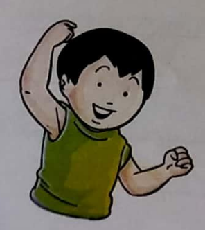
We have a strong head.

Our body consists of many parts. Let us know about these parts :